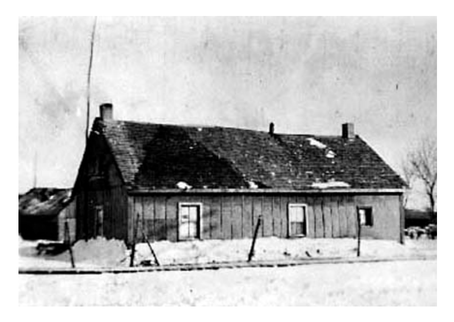
J.-B. Charette Home, St. Norbert, circa 1925. PAM, Still Images Section. St. Norbert Collection. -- Homes. Item Number 3.